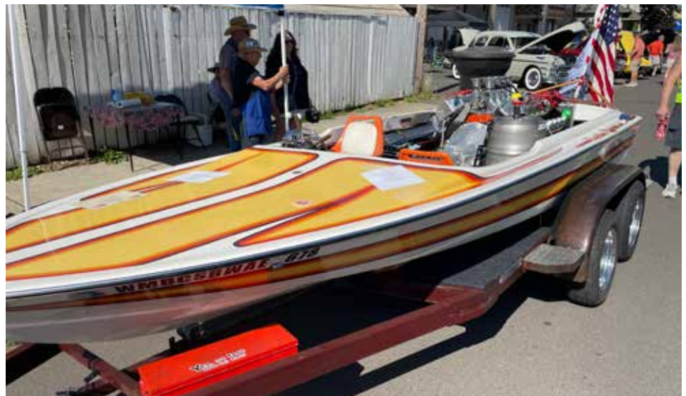
Jim Wheat sent this picture of a speedboat from the Donald Daze show on July 13. Except it isn't a speedboat. The sign accompanying the boat said, "1980 Bayen flat-bottom ski boat. Keith Black 500CI Hemi V8, three-speed automatic transmission, Halibrand V-drive. This is no longer a water vessel; it is a self-propelled trailer. The front axle of the trailer is driven. Steering is via 12V liner actuator and differential braking. Parade speed is 2-3 mpg, top speed is 30 mph. Built with NO special purpose, NOR any future value, just "get it done and enjoy the ride."